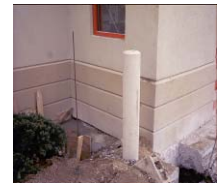
Facilities Group built a supplemental footing.