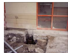
Underpin foundation with resistance piers.