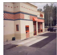
Arby's back in business.