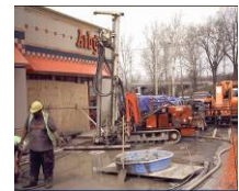
Nicholson drilling to fill mine voids.