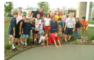
Local children making handprints in wet concrete